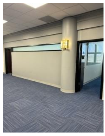
View of Conference Rooms