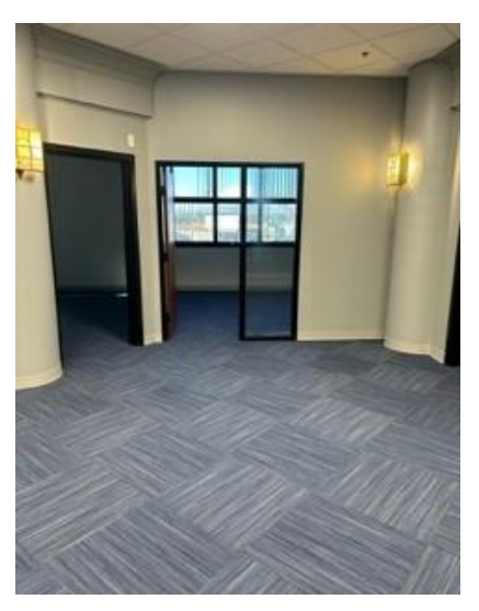
View of Offices