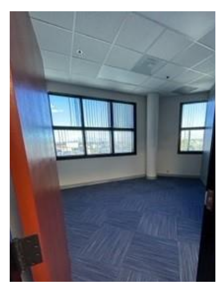
Board Secretary's Office