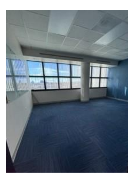
Conference Room B